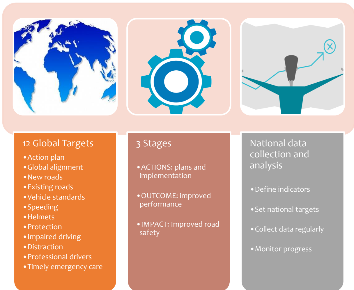
Figure 2. Summary of the key elements contained in this document