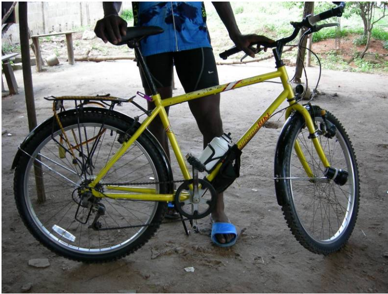
Figure 3: ITDP's California Bike (shown by captain of the Ghanaian cycling team)

will be cooperation with localized groups such as "Jeunesse et Sports," or Youth and Sports advocates, as well as local retailers who may wish to sell the CA Bike. Such decentralised cooperation is now viewed as essential to the success of transportation projects. Indeed, the development of bicycle and bike trailer projects in Africa has been largely the result of cooperation between organisations such as ITDP, the Swedish International Development Agency (SIDA) and others.