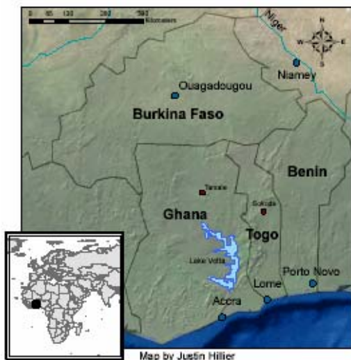
Figure 4: Locator map for Tamale and Sokodé

will be cooperation with localized groups such as "Jeunesse et Sports," or Youth and Sports advocates, as well as local retailers who may wish to sell the CA Bike. Such decentralised cooperation is now viewed as essential to the success of transportation projects. Indeed, the development of bicycle and bike trailer projects in Africa has been largely the result of cooperation between organisations such as ITDP, the Swedish International Development Agency (SIDA) and others.