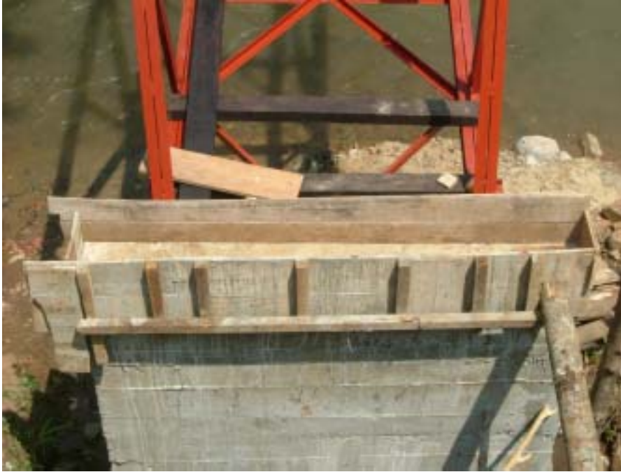
4.25 Shuttering set up around the top of the abutment to cast the concrete bearing cap.