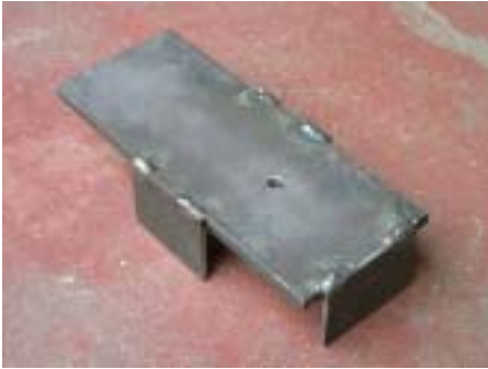
3.8. Drilling template for Base Panel Cross Members (Figure B10.4)