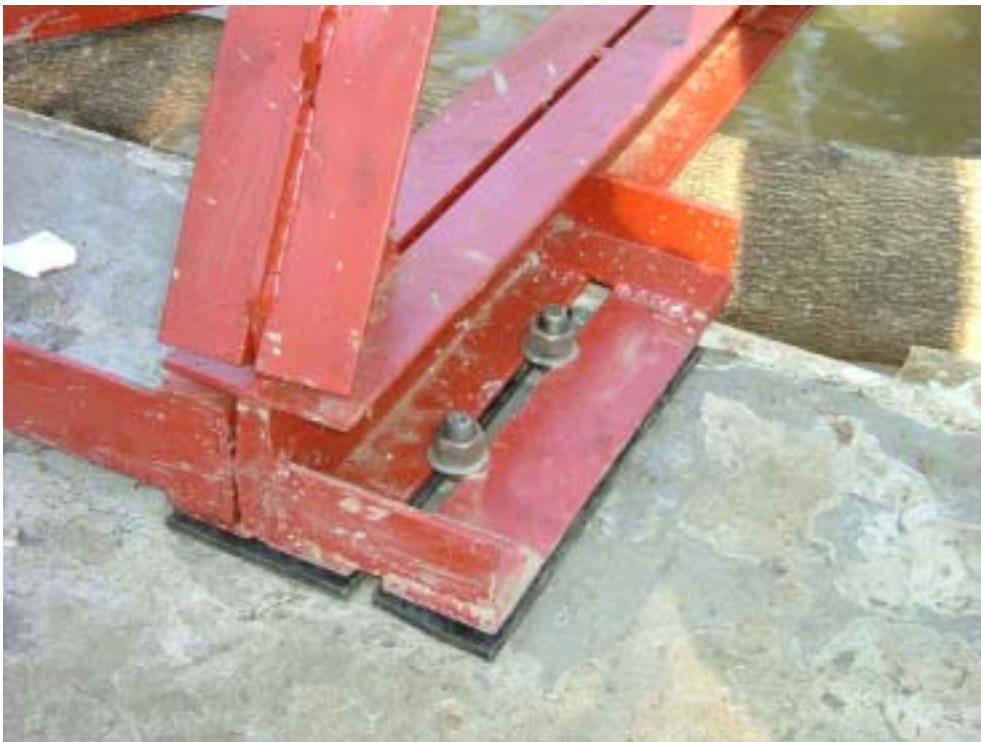
4.28 Bearing foot at the Fixed End of the footbridge. Note the rubber sheet used to support the foot.