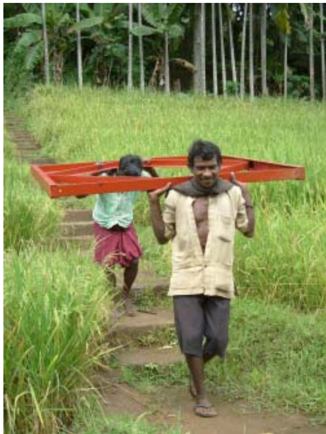
4.12 Carrying a Base Panel to Site.