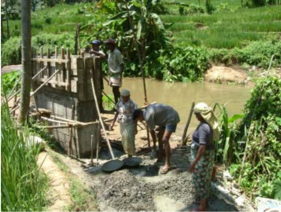
4.5 Mixing and pouring the concrete for construction of an abutment.