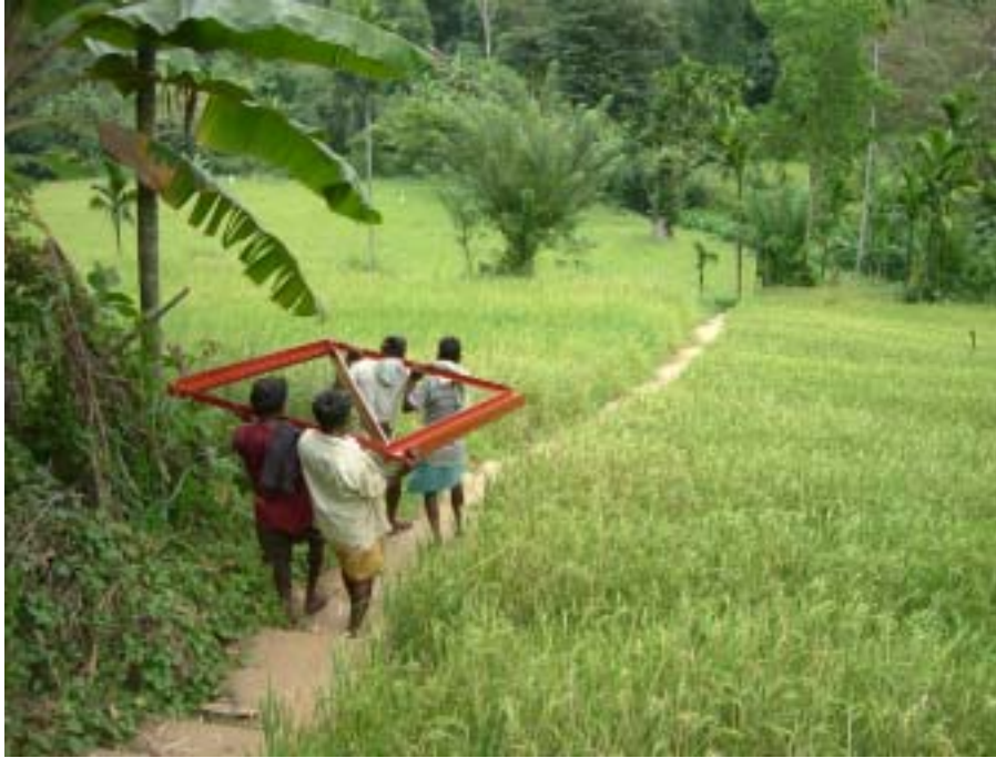
4.11 Carrying a Side Panel down the steps to the site.