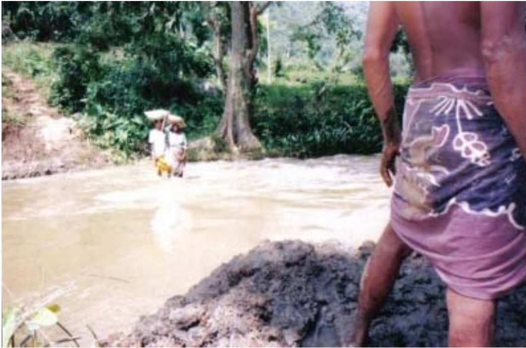
The site where the footbridge was located with women crossing at the ford. Note the steps leading down to the river.