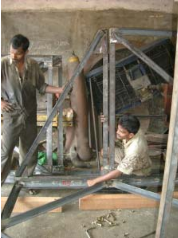
3.16 Beginning assembly of the Panels at the Left Hand end of the footbridge. Note the Base Panel Longitudinal (BL) fitting inside the Side Panel Bottom Longitudinal (SB)