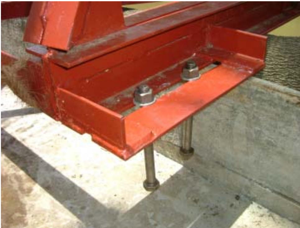
4.26 The end of the footbridge supported on the shuttering with the fixing bolts hanging from the bearing foot.

Note at the other end reinforcing steel pins (NOT BOLTS) are fitted in a similar manner allowing the end of the footbridge to slide to allow for expansion and contraction with temperature change.