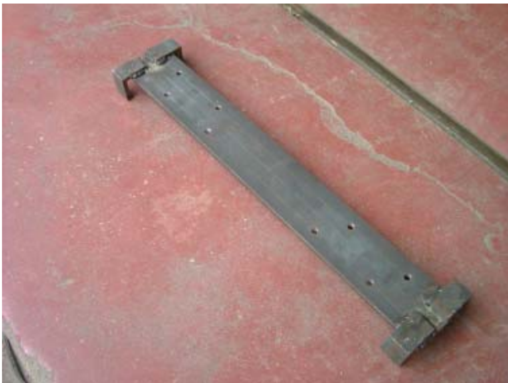
3.6 Template for drilling pilot holes in the joining brackets.