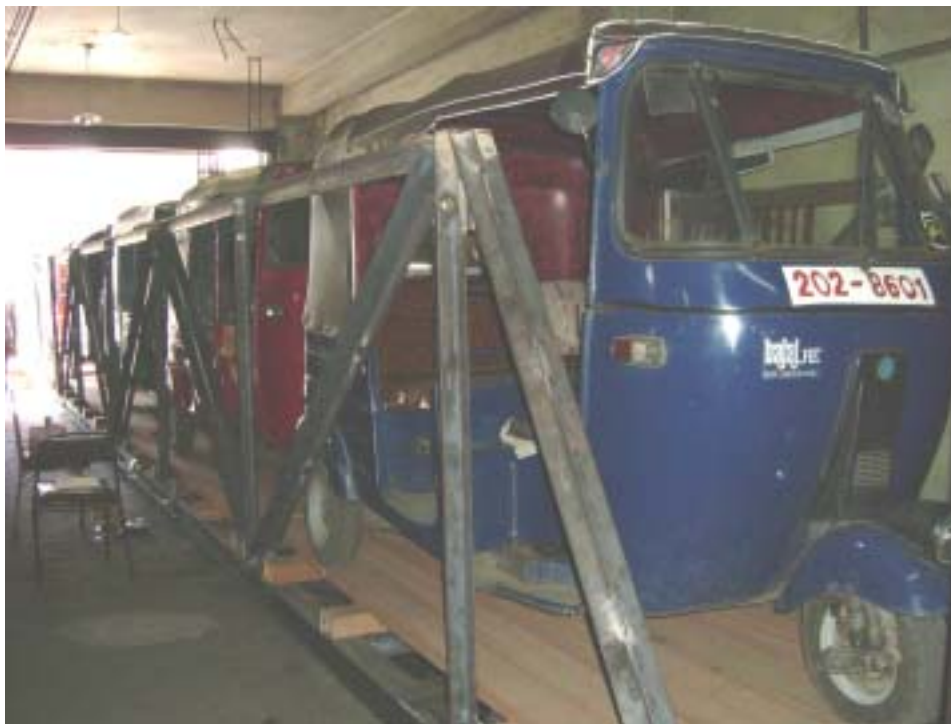
3.19 6 Bajajs (3-wheel taxis) loaded on the footbridge to test it in the workshop. This gave a total load of about 2 tonne, only about 22% of the design load but well above the maximum load expected in service. Ideally the footbridge should have been tested with a crowd load. However, strain gauges were attached at critical points to predict the effect of larger loads.