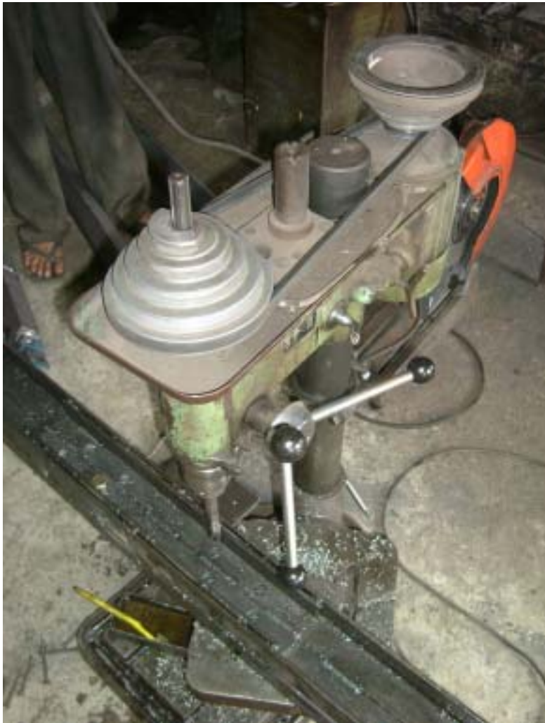
3.9 Drilling holes for joining the Side Panels (Figure B11.5). Note the Joining Bracket is tack welded inside the joining Side Panel Bottom Longitudinals . Similarly the Base Panel Longitudinal is tack welded in the opposite side.