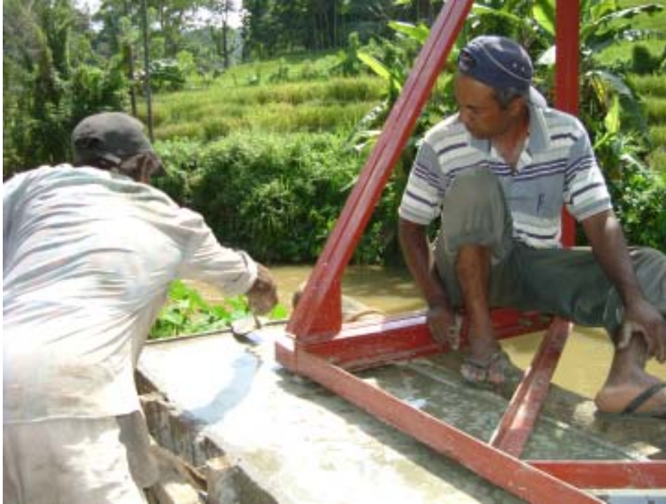
4.27 Completing the concrete bearing cap