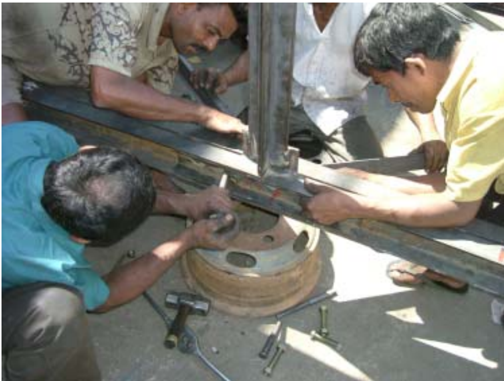
3.17 Lining up the holes at the bolted joint between adjacent side panels. Note the Joining Bracket fitted inside the channel of the Bottom Longitudinal.