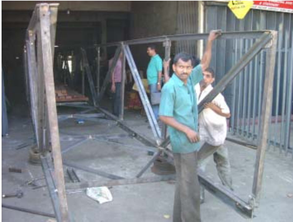
3.18 Assembly in workshop almost completed.