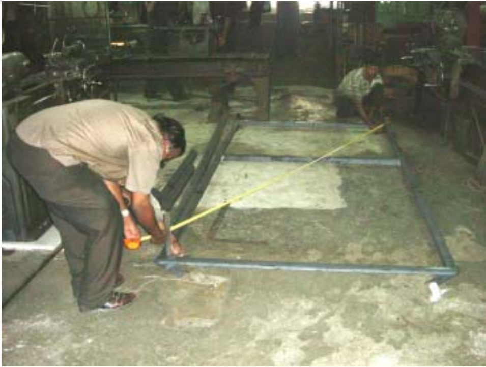
3.10 Checking the lengths of the diagonals in constructing the assembly jig (see Figure B12(i)). Note that jig is being set up on a flat floor area.