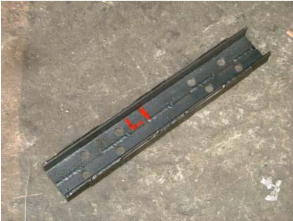
3.5 Joining bracket with bolt holes drilled. Note the 3mm thick stiffeners welded on the top and bottom surfaces.