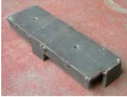
3.7 Drilling template for Side Panel Verticals (Figure B10.3)