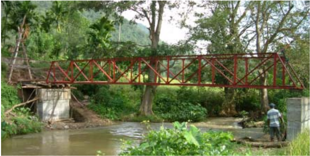
4.23 Fully assembled footbridge supported above the two abutments. Note that the pulling rope is now passed over the cross-member at the top of the tower in order to pull at an upward angle on the bridge