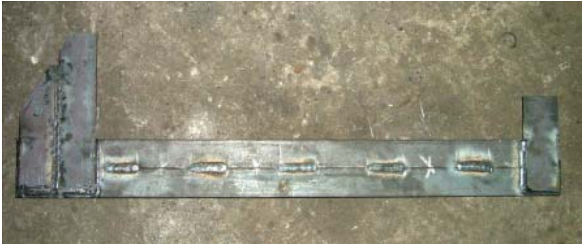
3.3 First step in welding up End Panel Bottom Longitudinal (EB) as in Figure B6, Step 1.2. Note 6mm space left around gussets for welding