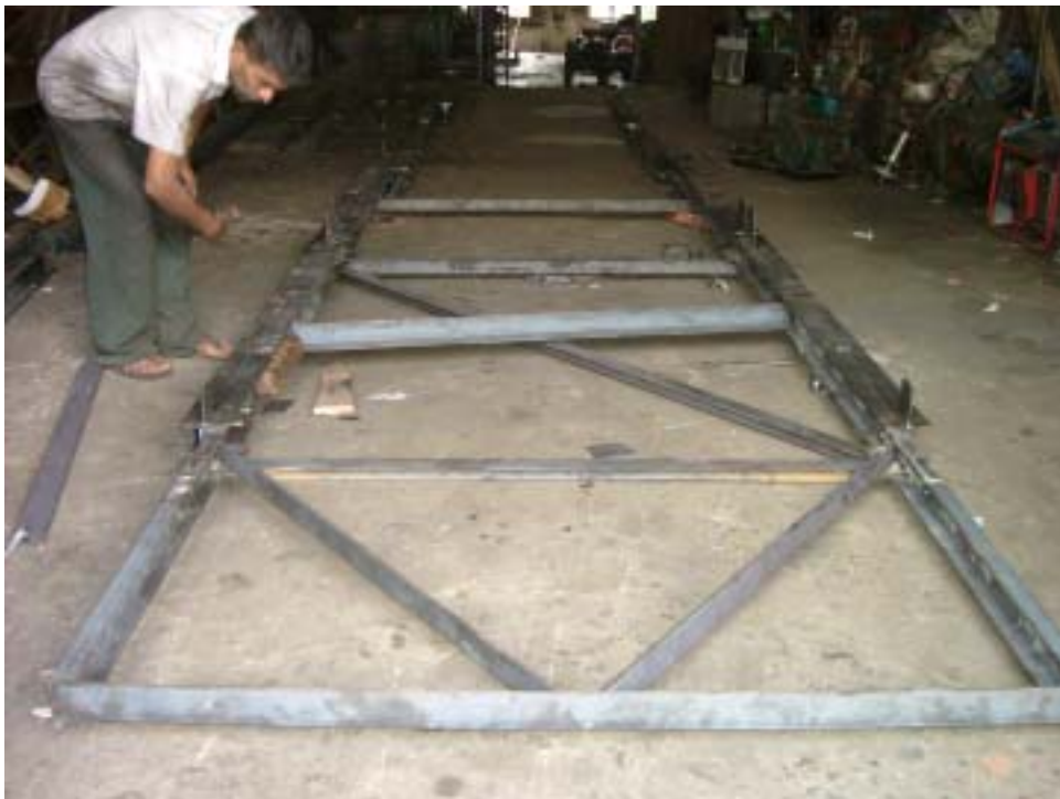
3.11 A base panel being assembled in the jig (see Figure B13). (Note that the lower frame resting on the floor is the jig). Note the bolting together of the joints between the Side Panel Bottom Longitudinals and the Base Panel Longitudinals.