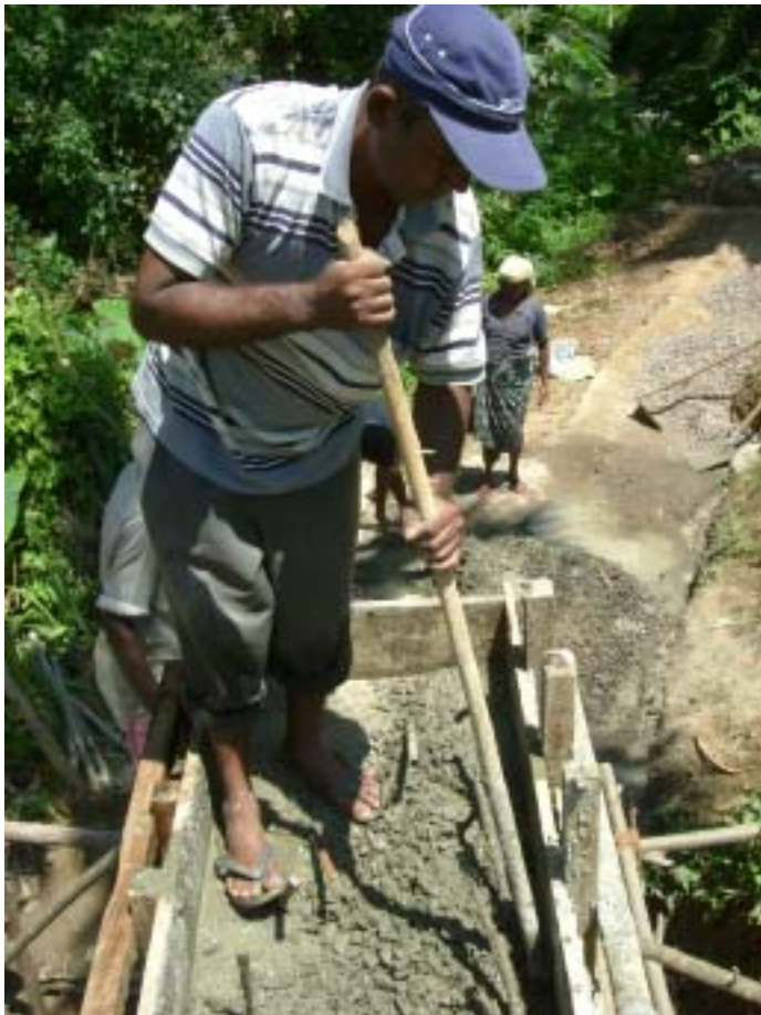
4.6 Tamping the concrete to make sure it is densely spread. Larger stones collected by the community are spread over the central section to reduce the volume of cement needed.