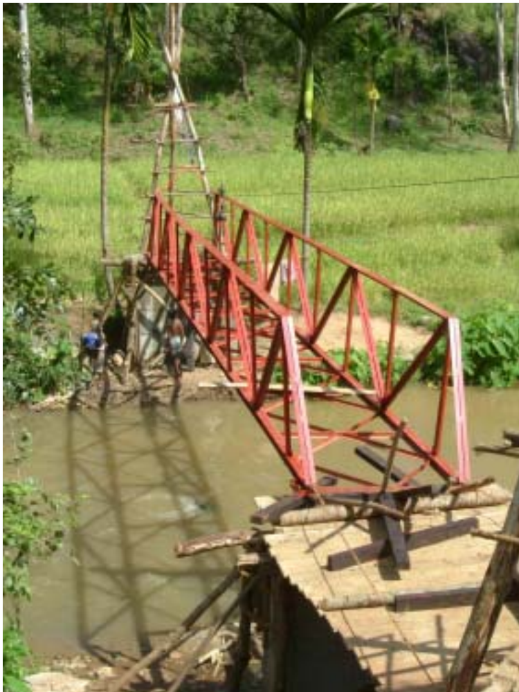
4.24 Assembled footbridge supported on packing at each abutment. Note that the pulley block is now supporting the centre of the bridge.