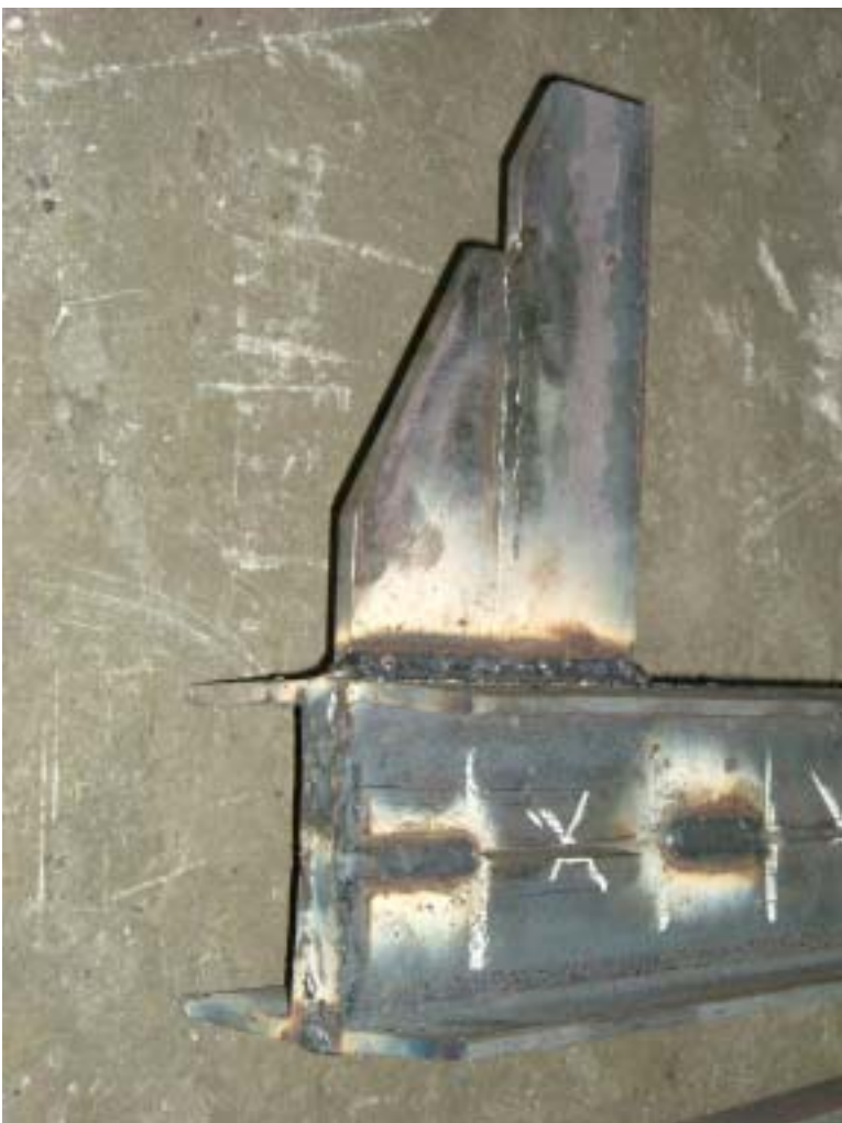
3.4 Completed welding of End Panel Bottom Longitudinal as in Figure B6, Step 1.3.