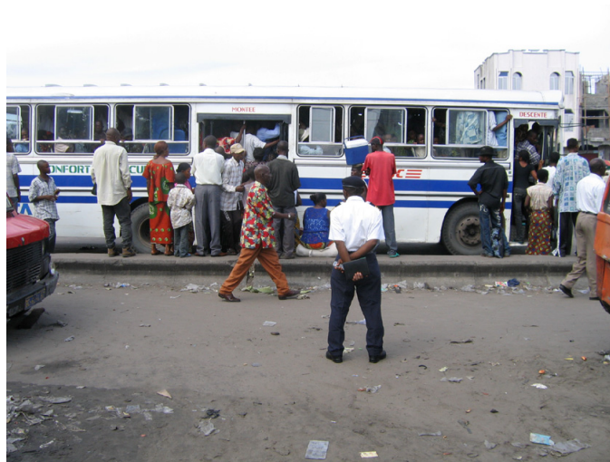
A full bus takes on more passengers in Kinshasa

STUC, a limited company, became operational in 2006. Its creation, made possible by a grant of $33.5 million from the government of India, marks a renewal of public transport in the country. The objective is to create an organized public transport system in Kinshasa.