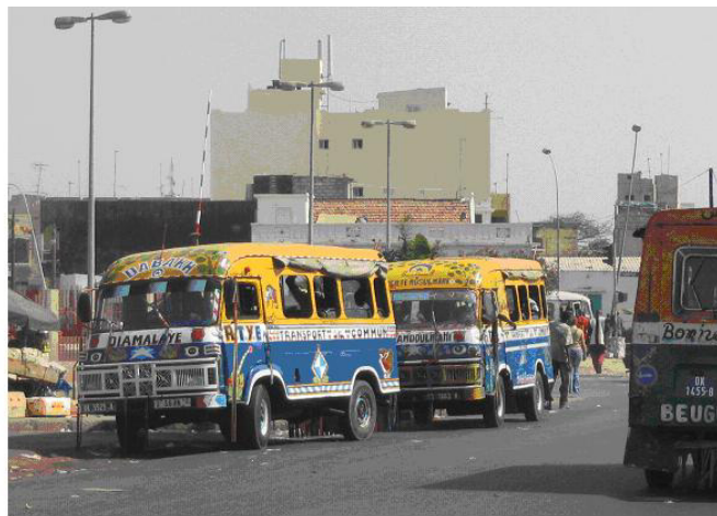
Cars rapides awaiting passengers in Dakar

In the past, efforts to provide route monopolies to DDD have not protected it from competition—indeed, the private sector has long met most transport demand. The cars rapides are by far the most common form of road-based public transport in the Dakar area. The fleet consists almost entirely of imported second-hand commercial vans, mainly Mercedes or Renaults, which are converted to passenger use on arrival. The reason for converting vans, rather than buying