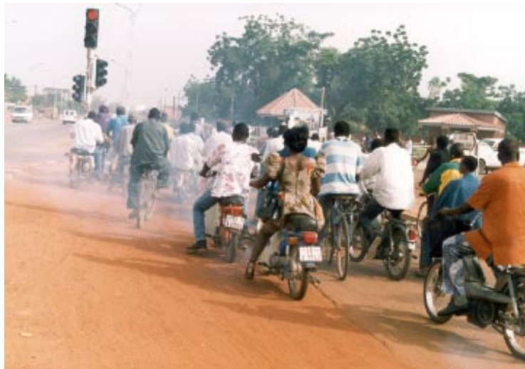
Motorcycles have caught on among urban Burkinabè

A fleet of 50 large buses (of which only about 33, and sometimes as few as 16, are operable) is operated by SOTRACO, a limited liability company created in 2003 to succeed the defunct Société de Transports Alpha Oméga, which wound up its operations in 2000 after encountering serious financial difficulties. SOTRACO began operations in November 2003. Its objectives were to develop a public–private partnership involving experienced private operators in the transport sector in Ouagadougou, and to delegate management responsibilities to private shareholders.