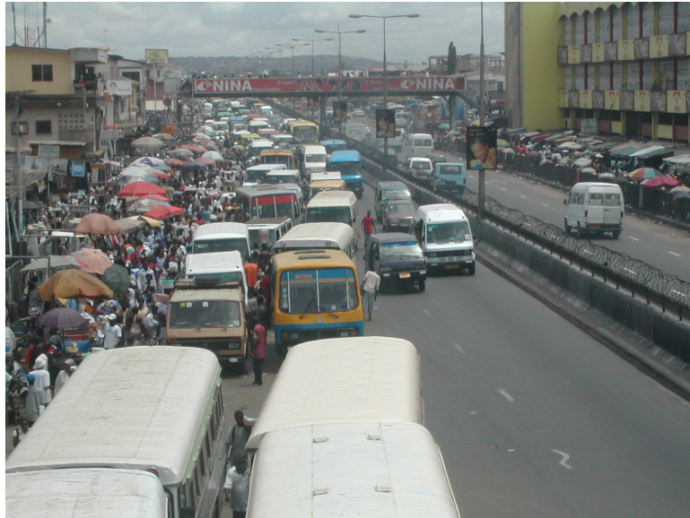
Spillover at a bus stop in Accra blocks an arterial highway

Permit fees are very low (as little as $4 per year). Assemblies are reluctant to impose unilateral increases for fear of losing income to a neighboring assembly. Permits are issued on demand to any qualified driver whose