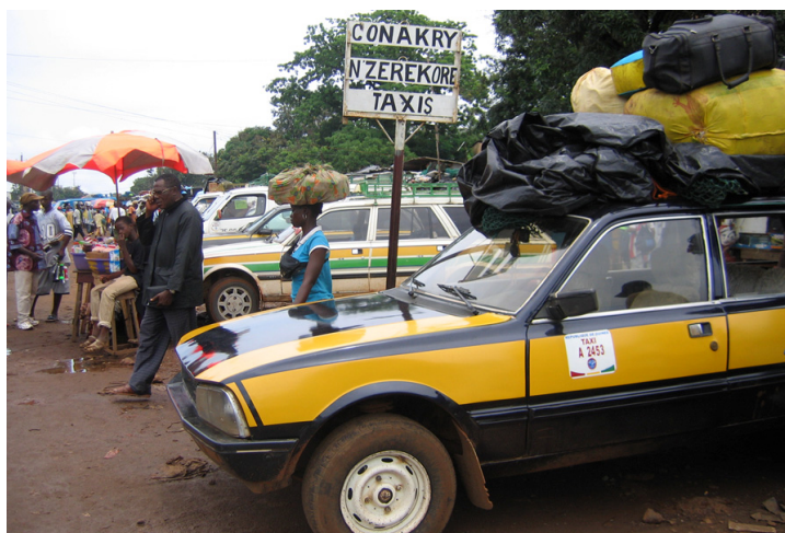
An overloaded Peugeot 505 at a taxi stand in Conakry

Unions of transport operators are active in each commune. Originally drivers' unions, the groups have many members who have become owners; indeed, the unions themselves may own some vehicles. Affiliated with the FSNP-TMG (Transport and General Mechanical Engineering Federation), the unions manage road transit centers in each commune. Union agents (three to six per transit route) supervise traffic and deal with accidents. In other respects, the unions differ from