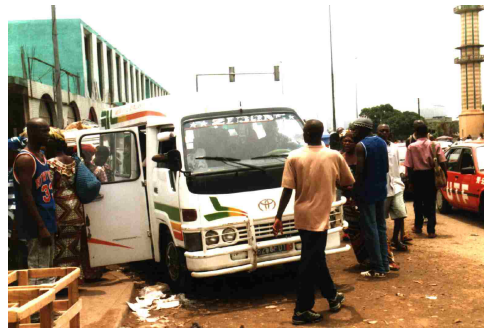
Minibuses provide about 19 percent of the city's urban transport