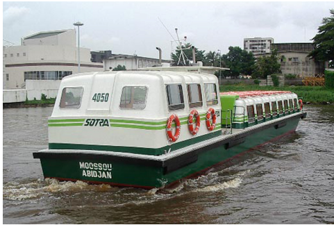
A fleet of “boat buses” connects parts of Abidjan separated by a lagoon

Vehicle importation and initial inspection are handled in a structured manner by a branch of the Ministry of Transport, the Service Autonome du Guichet Unique Automobile , or one-stop shop, while regular inspections are carried out by a private concessionaire, Société Ivoirienne de contrôle technique automobile (SICTA, a subsidiary of SGS). The government sets bus fares. The operators of buses and minibuses are organized into several associations and unions. The Syndicat National des Transporteurs de Marchandises et de Voyageurs de Côte d'Ivoire (SNTMVCI) is one of the national associations of operators. Unions perform self-regulatory functions.