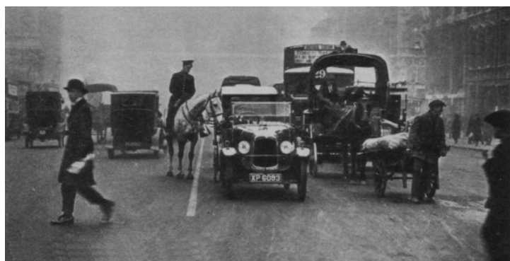
Figure 1. First white line in London (image reproduced from Morton, 1934)

Looking back a little over 80 years, at the early stages of the motor age, the presence of congestion was already being faced. The experimental solution of the time to address this was to paint the first white line in a London street (see Figure 1).