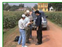
Measuring California Bearing Ratio (CBR) using a low cost Dynamic Cone Penetrometer (DCP).

An Engineered Natural Surface (ENS), or Earth Road, is the cheapest form of road construction, using the compacted soil at the road location. This solution can be used for low traffic flows (normally up to 100 light motor vehicles per day) in gentle terrain with rainfall less than about 2,000mm per year if the soil is moderately strong (CBR of about 15 or more). Use may be restricted during and immediately after heavy rain.