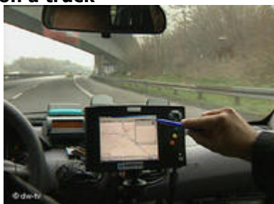
Figure 1. GPS-based on board unit mounted on a truck