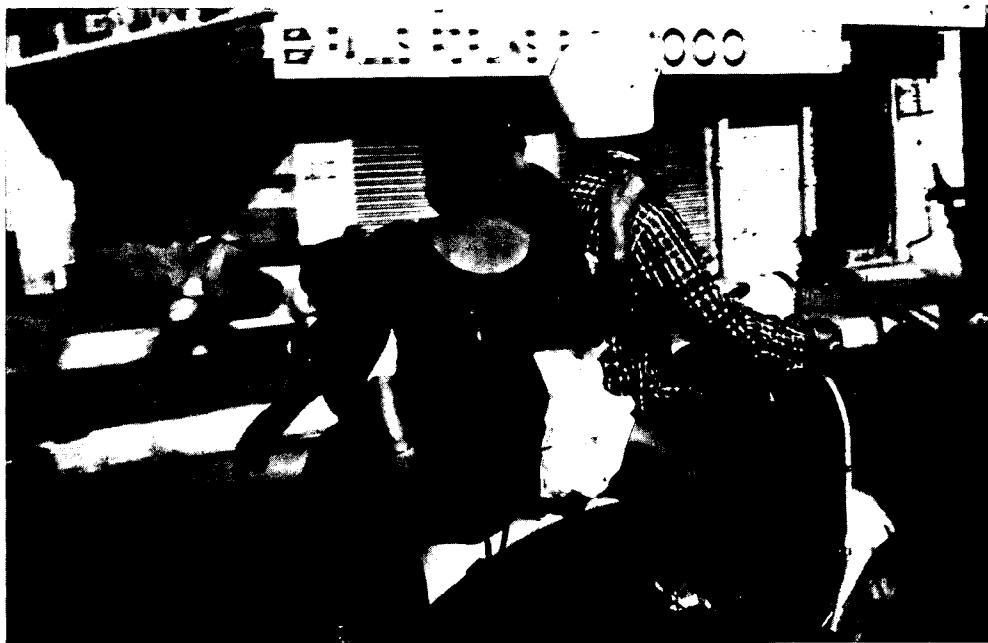
Plate 1 Overloaded commercial vehicles