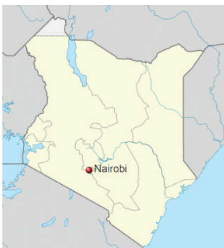
Map data ©Uwe Dederig [CC BY-SA 3.0]

Nairobi, Kenya's capital, is a rapidly growing city with an estimated population of 3.36 million inhabitants in 2014. With Kenya's rapid urbanization rate of approximately 4.36 percent per annum, 75 percent of newcomers to the city will end up in informal settlements such as Kibera that lack many basic infrastructure services and amenities. This contributes to high levels of inequality between those who can afford to live in serviced areas, and those who cannot. The City is largely unprepared for rapid growth, and this is most apparent on its roads.