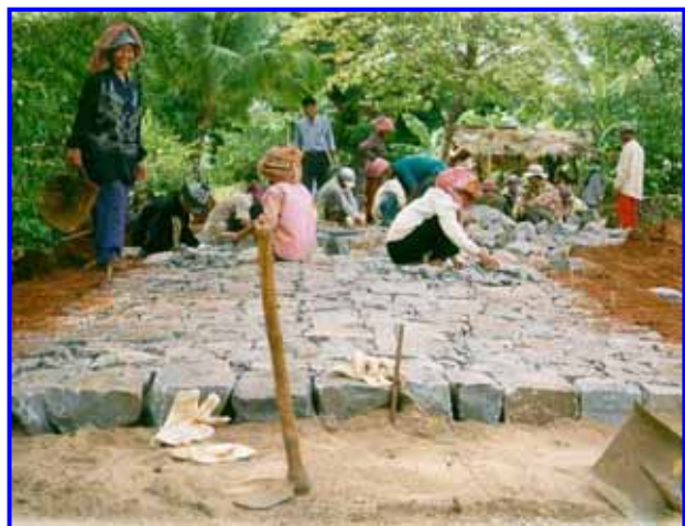
Image 2 – Dressed Stone Paving under Construction

Fortunately there is a range of alternative low-cost surfacings which are already proven and used in various locations around the world. These methods can use