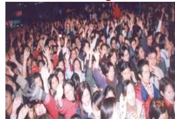
Green City Forum