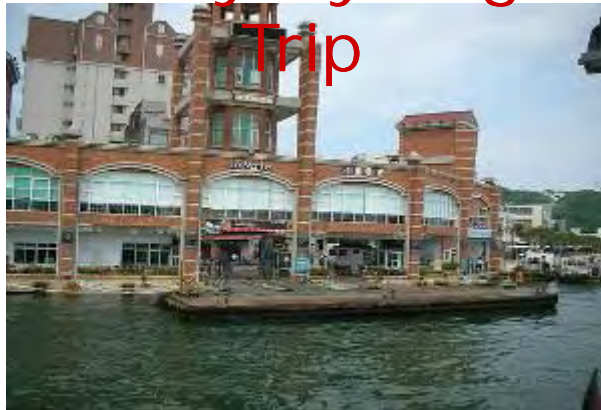
Cijin Crazy Ferry-Cycling Trip