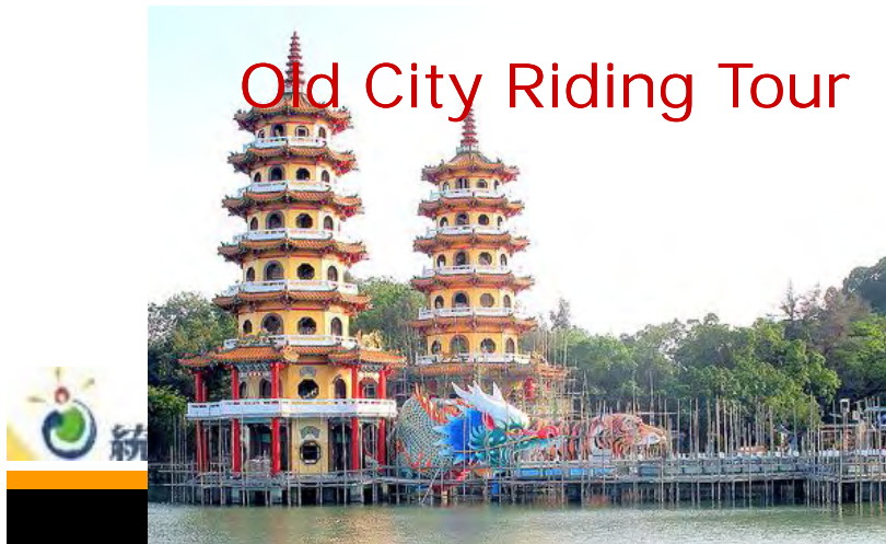
Old City Riding Tour