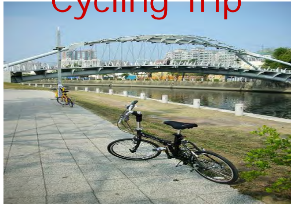
Weekly Arrangement, Monthly Activity Ai River Cycling Trip