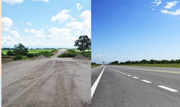
RN1 Variante 38