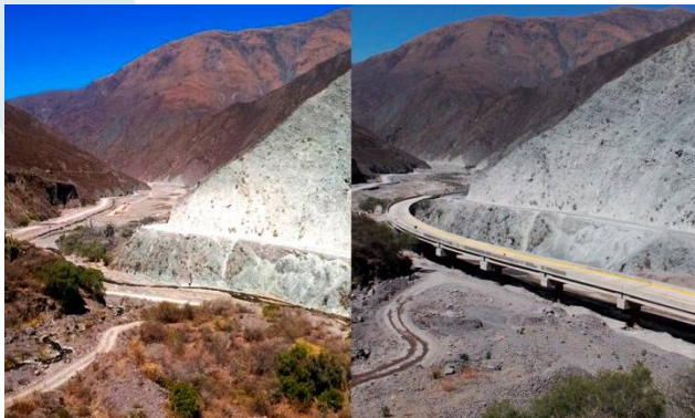
RN51 Viaducto El Candado