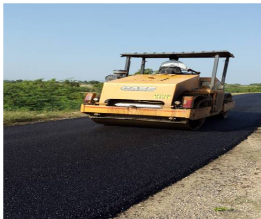
IMAGE 13 compaction of cold mix MSS