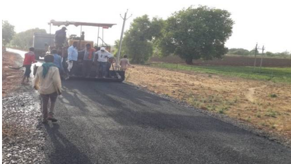
IMAGE16 laying of cold mix seal coat