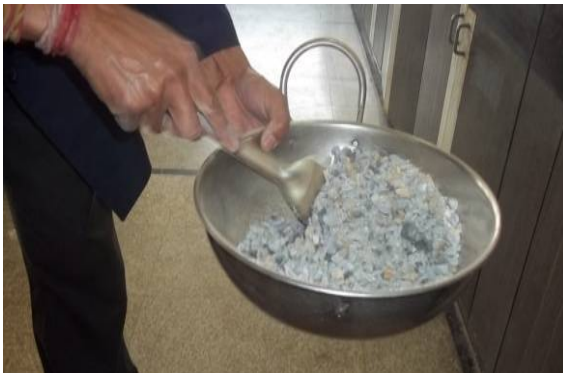
IMAGE 1 mixing of 10 mm, 6 mm & fines