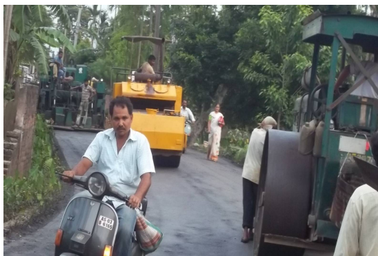
IMAGE 14 laying & compaction cold mix SDBC

Execution of Cold Mix SDBC is being implemented to meet the specification of IRC: SP : 100 – 2014 only with satisfactory result. No other emulsion based cold mix company is so far able to execute Cold Mix SDBC in India. It is viable only for Tailor made cold mix technology.