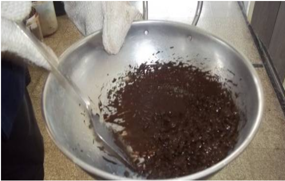
IMAGE3 preparing cold mix SDBC