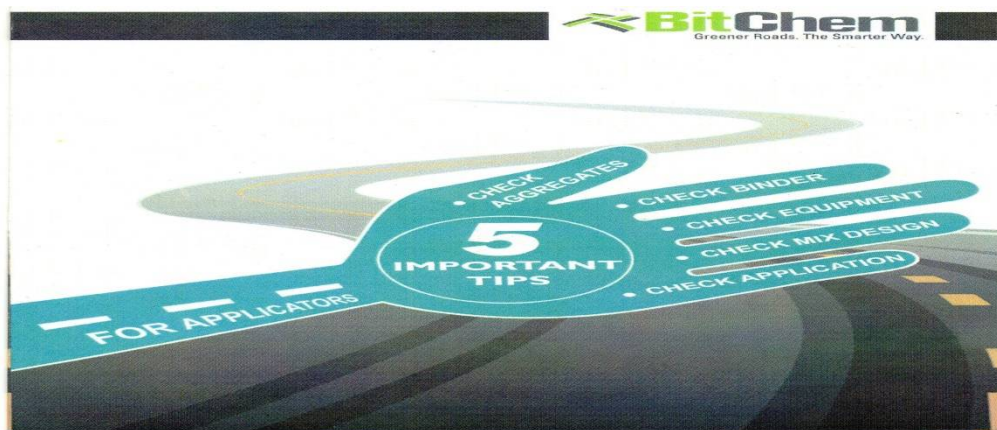
IMAGE 11 five finger tips of cold mix application