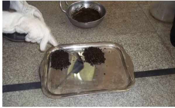
IMAGE 4 prepared mix is kept on to a tray