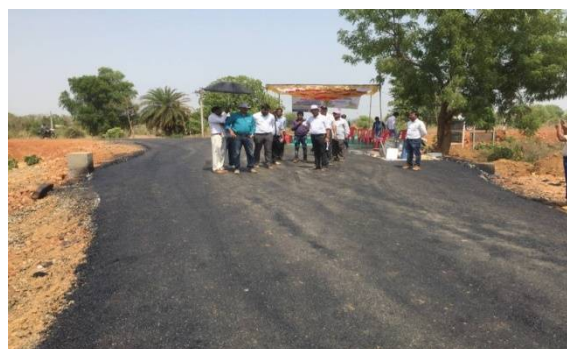
IMAGE17 completed seal coat surface