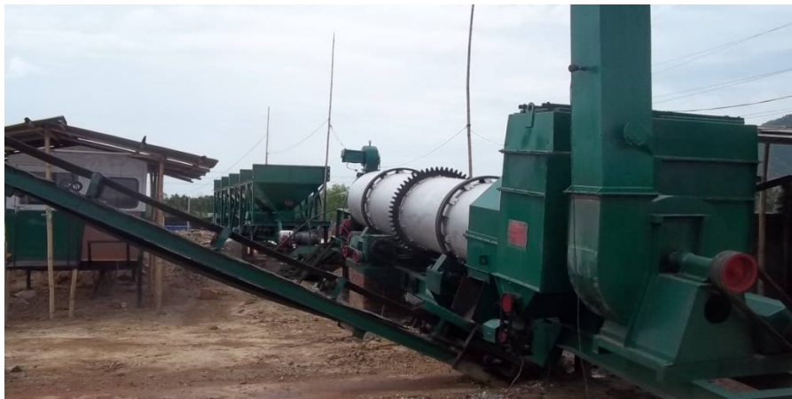
(d) 1 IMAGE 8 existing HMP

It is a modified HMP through suitable conversion kits with adequate heat tracing tap to eliminate the need of heating and burning with heat tracing assembly.