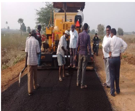
IMAGE 12 laying of cold mix MSS