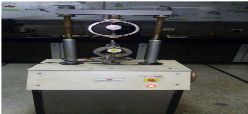
IMAGE 6 Marshall Equipment