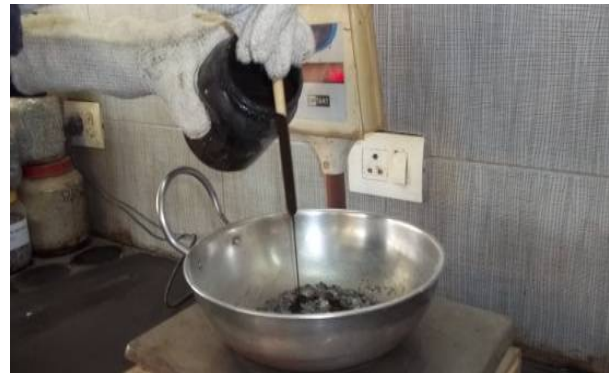
IMAGE 2 adding cold mix binder as per gradation