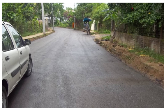
IMAGE15 completed cold mix SDBC road