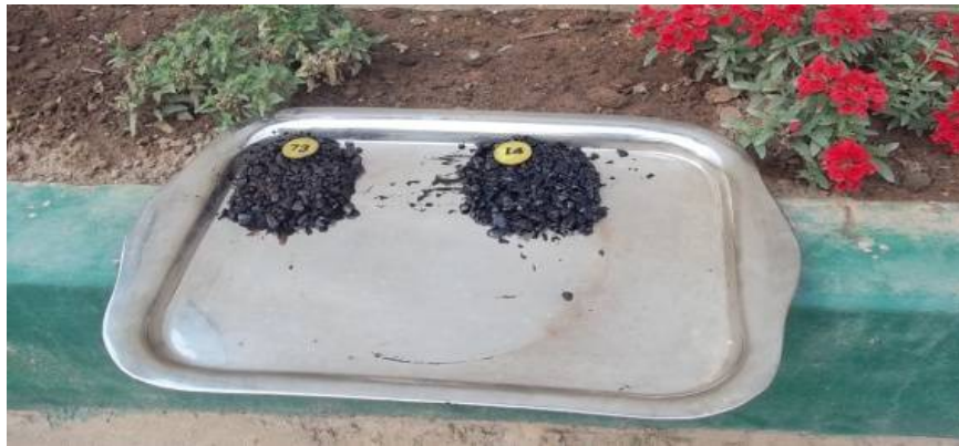
IMAGE5 the mix is kept under Sun light to know the breaking- setting-lead time, Coating & adhesion