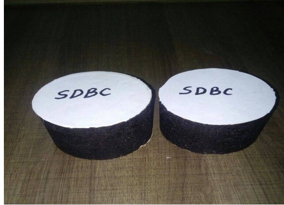
IMAGE 7 mould of cold mix SDBC prepared for Marshall test