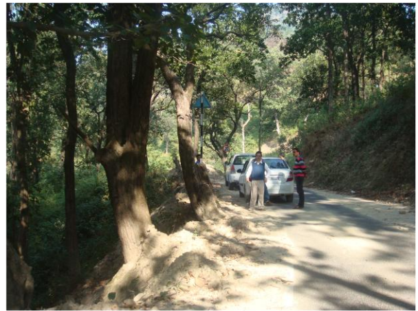
b) Unprotected/Undelineated Trees can be Severe hazards