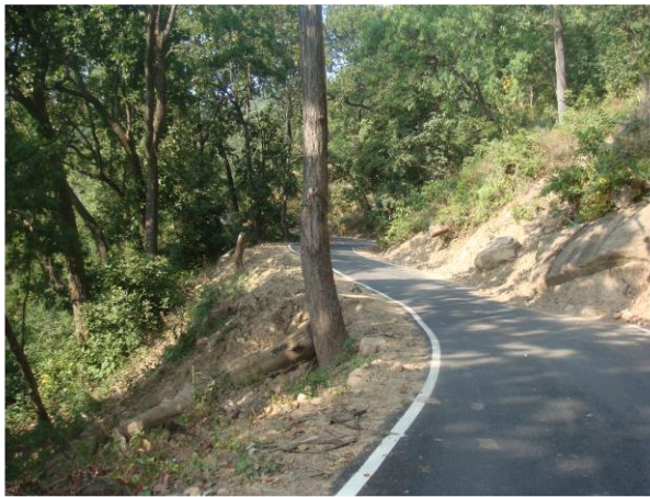
a) Unprotected/Undelineated Trees can be Severe hazards

Unshielded road side trees are very serious hazards. They need to be delineated prominently for night time driving.