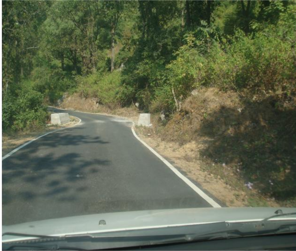
a) Delineation of the Culvert head walls and trees is essential