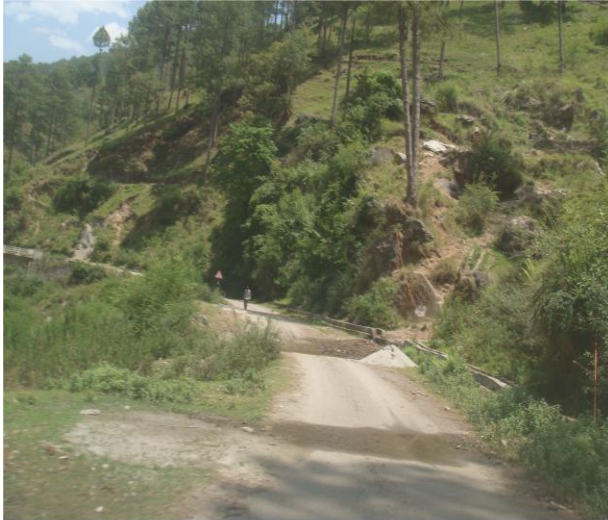
a) Road Side Irrigation Channels need to be controlled from spilling the water and eroding the road