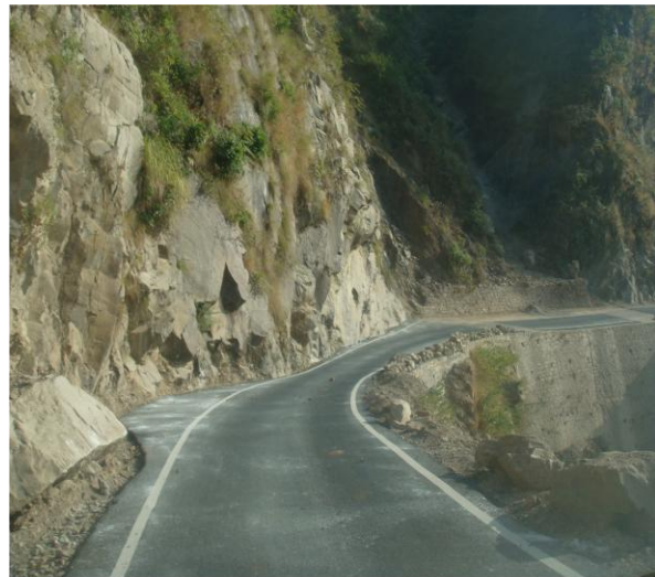
b) Vertical Retaining Wall to Support the Road