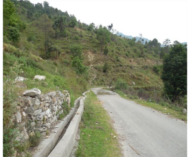
b) Road Side Irrigation Channels need to be controlled from spilling the water and eroding the road