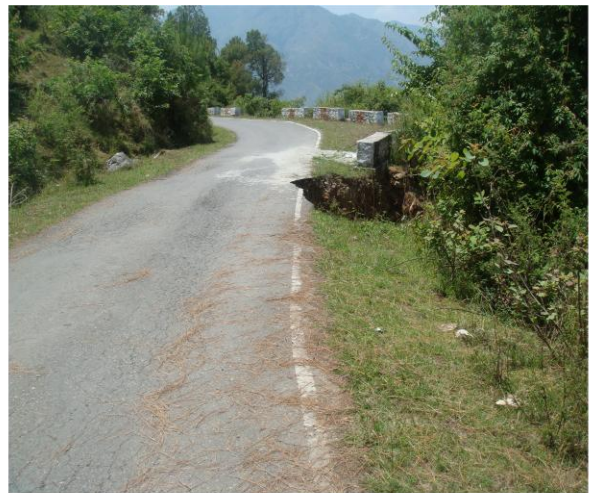
B) Blocked Drain can Erode the Road