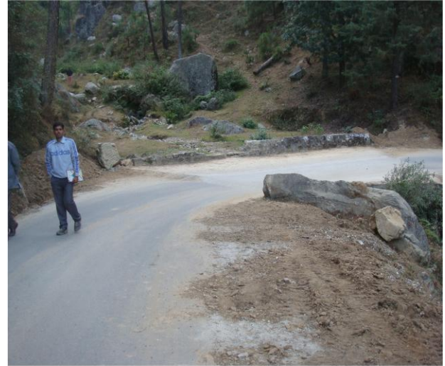
b) Out Crops of Rocks can cause crashes on hill roads.