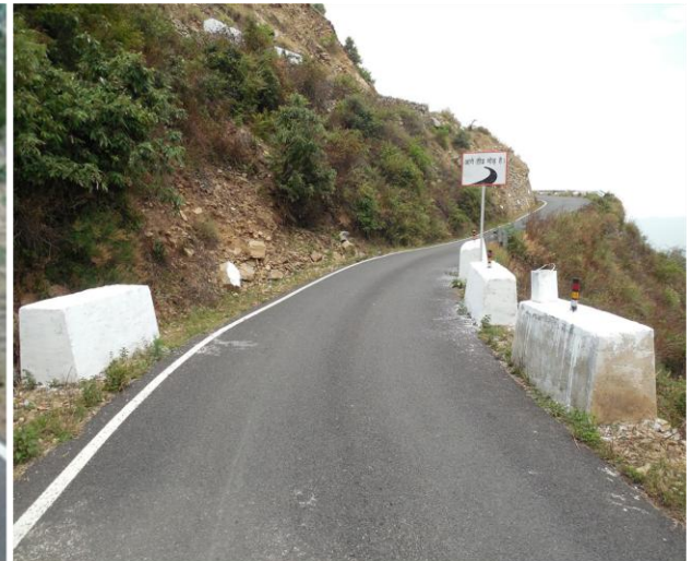
b) Un-Conventional Sign posted to warn about Hair-Pin Bend