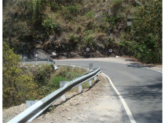
b) Blind Curve Followed by Steep Slope/Gorge