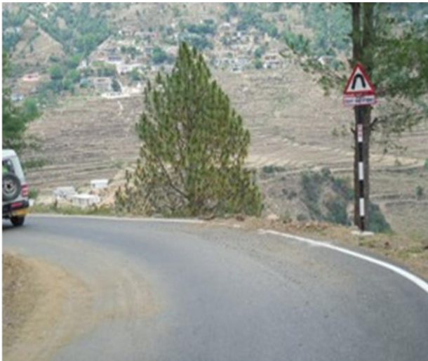
a) Hair-Pin Bend Sign posted at the Apex of the Curve

In steep hills blind curves are very common requiring appropriate signs and indicators to the oncoming vehicles. At these blind curves, in some locations, it is observed that the warning signs are posted very close to the start of the curve at unusual heights and speed limit signs are not supporting the safe operation and control of the vehicles both in the dark hours or even in day light. Some of the cases are illustrated in the photos below.