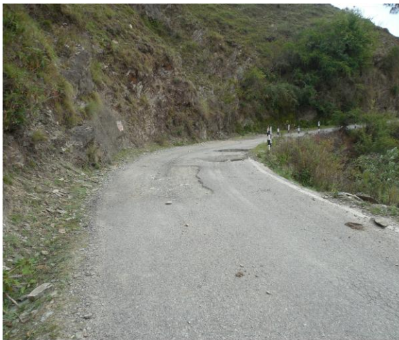
a) Absence of Drain can Erode the Road

Improper construction and maintenance of cross drain works can be potential accident spots as they can erode the road surface and sometimes can wash away the vehicles. Some examples are shown in the photographs below.