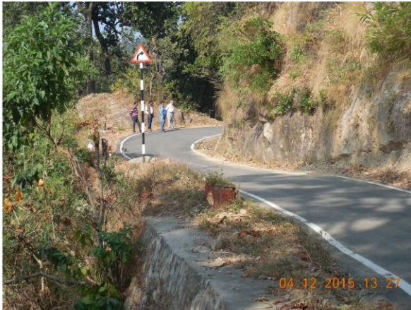
a) Warning signs are posted very close to the sharp blind curve at higher level