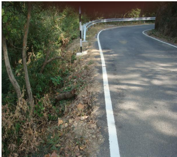
a) Steep Valley Slope having no space to post Barrier

By virtue of the terrain it is not easily possible to provide recognizable shoulders. Many of the places the edge of the carriageway is almost at the brims of the hill slopes. In some situations it is not even possible to post W-Beam crash barriers to protect the vehicles from running down the slope. Photos below show some of these situations.