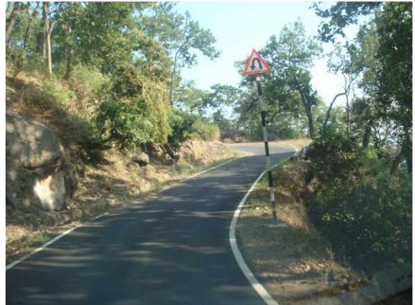
b) Warning signs are posted very close to the sharp blind curve at higher level